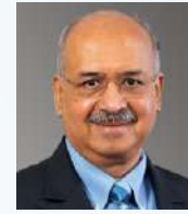
Dilip Shanghi Chairman & MD Sun Pharmaceutical Industries Ltd.