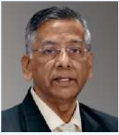
R. Venkataramani Attorney General for India