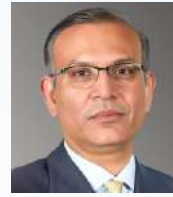
Jayant Sinha Member of Parliament & former MoS, Finance and Civil Aviation, Govt. of India