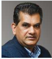
Amitabh Kant Ex- India's G20 Sherpa & former Chief Executive Officer NITI Aayog, Govt. of India