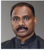
Girish Chandra Murmu, IAS (Retd.) former Comptroller & Auditor General of India