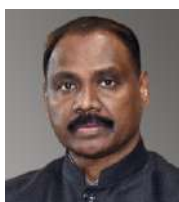
Girish Chandra Murmu, IAS (Retd.)

former Comptroller & Auditor General of India