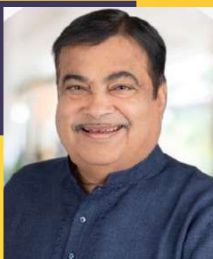
Shri Nitin Gadkari

Hon'ble Union Cabinet Minister of Road Transport & Highways Govt. of India