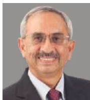
Nadir B. Godrej

Member of Parliament & former MoS, Finance and Civil Aviation Govt. of India