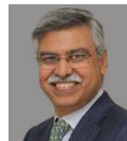
Sunil Kant Munjal