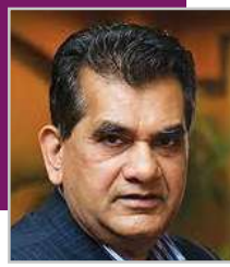
Mr. Amitabh Kant, IAS Chief Executive Officer NITI Aayog