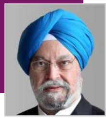
Mr. Hardeep Singh Puri Hon'ble Union Minister for Housing & Urban Affairs (I/C) Civil Aviation (I/C); & MoS Commerce & Industry Govt. of India