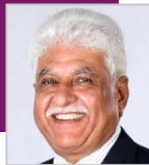
Mr. Rakesh Bharti Mittal Vice-Chairman Bharti Enterprises India