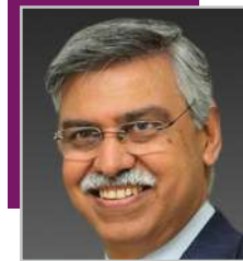
Mr. Sunil Kant Munjal Chairman Hero Enterprise