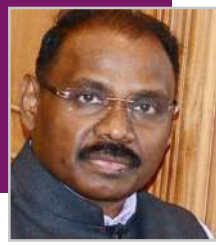
Mr. Girish Chandra Murmu, IAS Comptroller & Auditor General of India