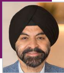
Mr. Ajay Banga Chief Executive Officer Mastercard Inc., USA