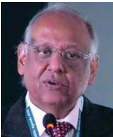
Anurag Goel, IAS (Retd.) Former Secretary Ministry of Corporate Affairs Govt. of India