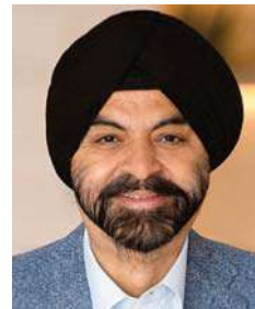
Ajay Banga President & Chief Executive Officer MasterCard Inc., USA