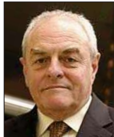
Prof. (Judge) Mervyn E. King SC Chairman, King Committee on Corporate Governance; Patron, Good Governance Academy, Chair Emeritus, IIRC & GRI and former Judge, Supreme Court of South Africa