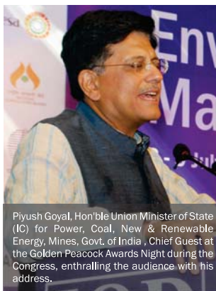
Piyush Goyal, Hon'ble Union Minister of State (IC) for Power, Coal, New & Renewable Energy, Mines, Govt. of India, Chief Guest at the Golden Peacock Awards Night during the Congress, enthralled the audience with his address.