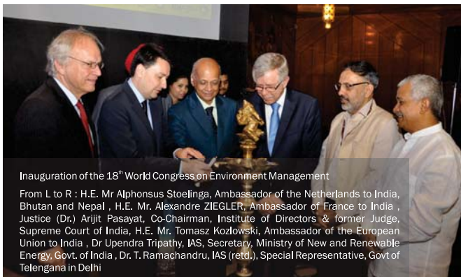
Inauguration of the 18 th World Congress on Environment Management