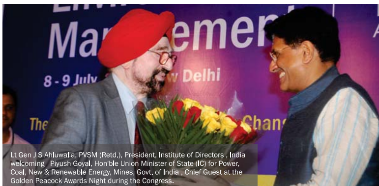
Lt Gen J S Ahluwalia, PVSM (Retd.), President, Institute of Directors, India welcoming Piyush Goyal, Hon'ble Union Minister of State (IC) for Power, Coal, New & Renewable Energy, Mines, Govt. of India, Chief Guest at the Golden Peacock Awards Night during the Congress.

briefed about Star Rating being adopted by mining sector in India, for ensuring compliance to national & local level environmental safeguards. Star Rating is part of Sustainable Development Framework being implemented by Indian Bureau of Mines (IBM).