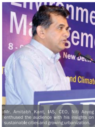
Mr. Amitabh Kant, IAS, CEO, Niti Aayog enthused the audience with his insights on sustainable cities and growing urbanization.