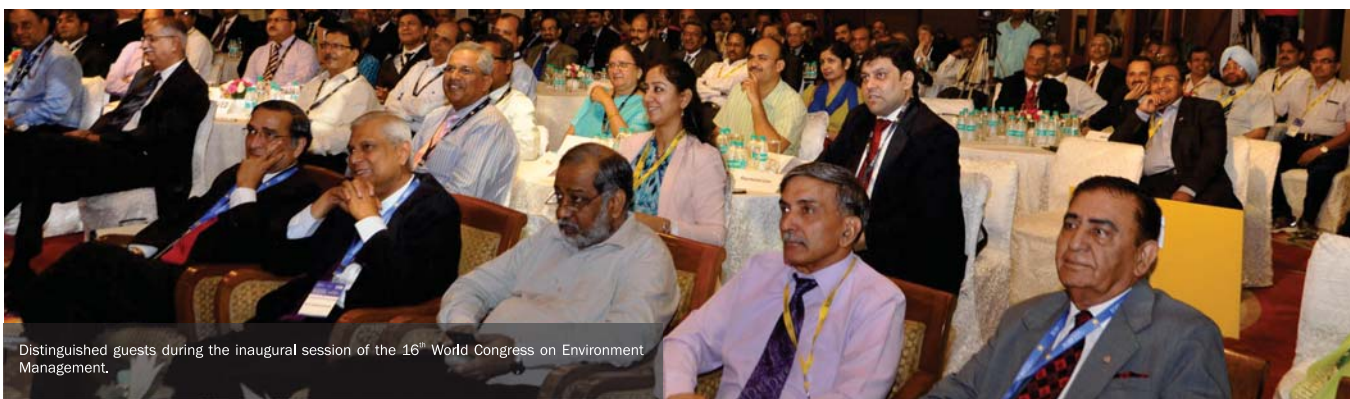
Distinguished guests during the inaugural session of the 16 th World Congress on Environment Management.

till the well has dried. Hospital records show that 50% of patients are suffering from water borne diseases. Article 21 provides provisions for Right to Life not merely physical existence but to live a life with dignity.