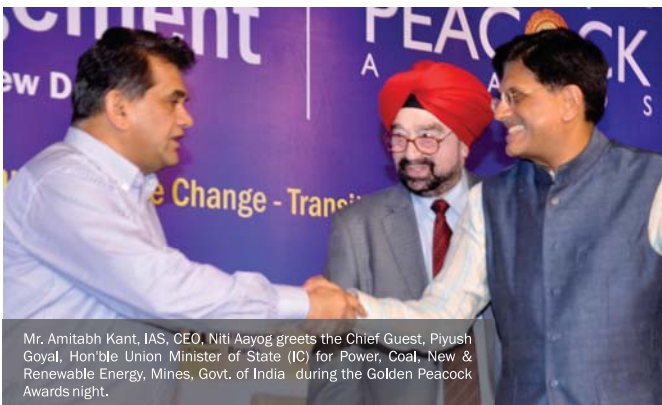
Mr. Amitabh Kant, IAS, CEO, Niti Aayog greets the Chief Guest, Piyush Goyal, Hon'ble Union Minister of State (IC) for Power, Coal, New & Renewable Energy, Mines, Govt. of India during the Golden Peacock Awards night.

Mr. Jain explained objectives of sustainable energy for all besides