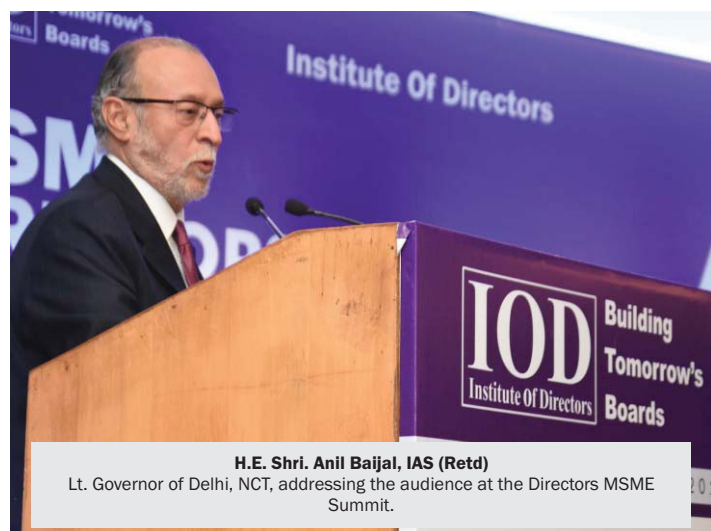
H.E. Shri. Anil Bajjal, IAS (Retd) Lt. Governor of Delhi, NCT, addressing the audience at the Directors MSME Summit.

H.E. Mr. Anil Bajjal, IAS, (retd) Hon'ble Lt. Governor, Government of N.C.T. of Delhi in his Chief Guest address said “MSMEs are emerging as essentially entrepreneur-owned and operated entities that individually may be very small and unregistered, but overall, they are very significant contributors to gainful employment, especially in the services sector, since skill building is an important instrument to