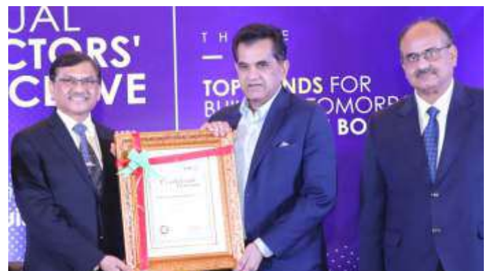
Mr. Amitabh Kant, IAS (retd.) presenting the IOD Distinguished Fellowship – 2022 to V Adm Narayan Prasad, AVSM, NM, IN (retd.) , Chairman and Managing Director, Mazagon Dock Shipbuilders Limited.