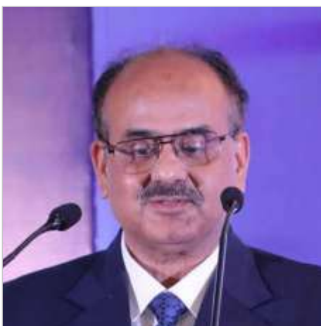
Dr. Ajay Bhushan Prasad Pandey, IAS (retd.) former Finance Secretary, Govt. of India delivering the 'Guest of Honour Address'