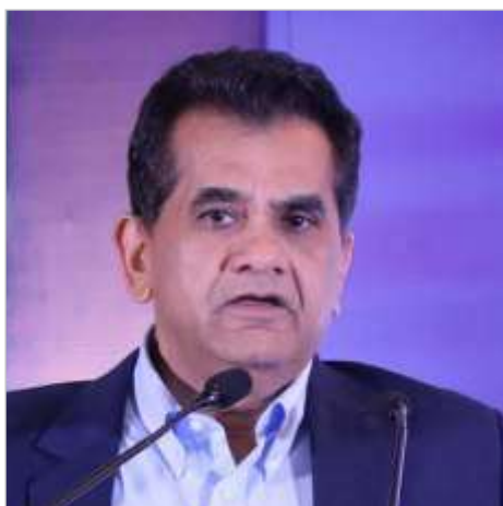
Mr. Amitabh Kant, IAS (retd.) India's Sherpa for the G-20 delivering the 'Chief Guest Address'