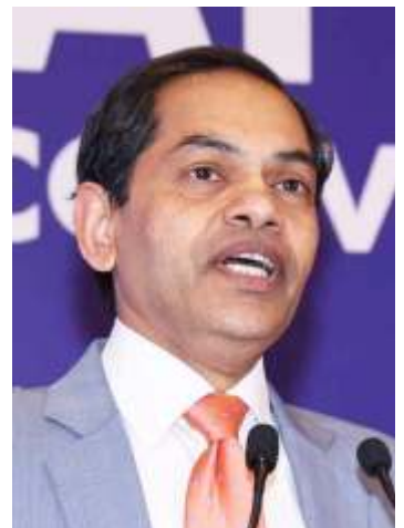
H. E. Sunjay Sudhir, IFS Ambassador of India to United Arab Emirates delivering the 'Guest of Honour Address'