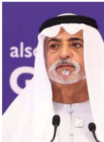
His Highness Sheikh Nahayan bin Mabarok Al Nahayan Hon'ble Cabinet Member and Minister of Tolerance & Coexistence Govt. of UAE delivering the 'Patron & Chief Guest Keynote Address'